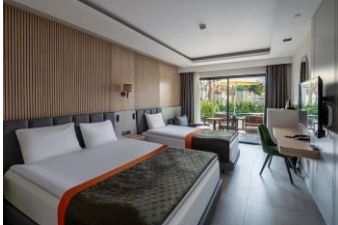
Deluxe Swim Up Room 37 m 2