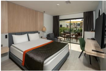
Deluxe Swim Up Family Room 63 m 2

In the area where the Deluxe Swim Up rooms are located, there is a separate 160 m 2 shared pool in addition to the main pool. On the shared pool terrace, each room has two sun loungers, one umbrella, two chairs, and one table.