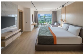
Executive Private Pool Suite 2 Bedrooms 175 m 2

In the area where the Deluxe Swim Up rooms are located, there is a separate 160 m 2 shared pool in addition to the main pool. On the shared pool terrace, each room has two sun loungers, one umbrella, two chairs, and one table.