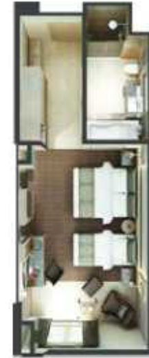
Deluxe Pool Room