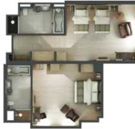
Superior Family Room