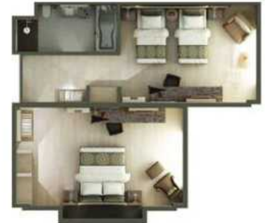
Deluxe Pool Family Room