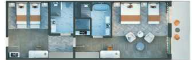
Deluxe Superior Plus Family Room