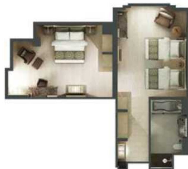
Deluxe Family Room